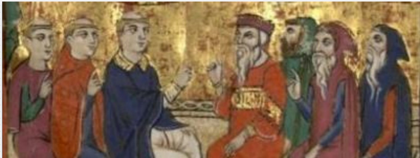
St. Athanasius at the Council of Nicaea